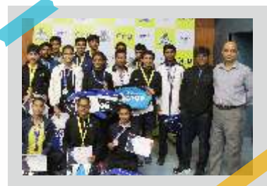
GMU Open Badminton Tournament